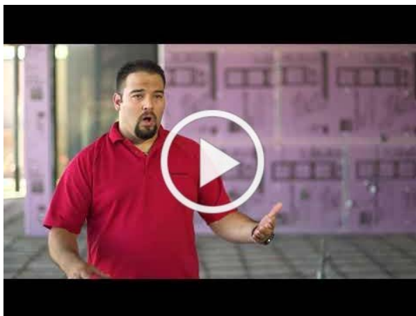
The 2019 New American Home: Phase 3