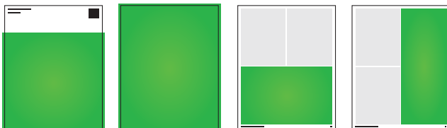
Back Cover (with bleed)

*Full-page ads are intended to bleed off the page; please include an additional 0.125" of bleed area on each edge. Please keep all important art and copy inset at least 0.5" from the page edge.